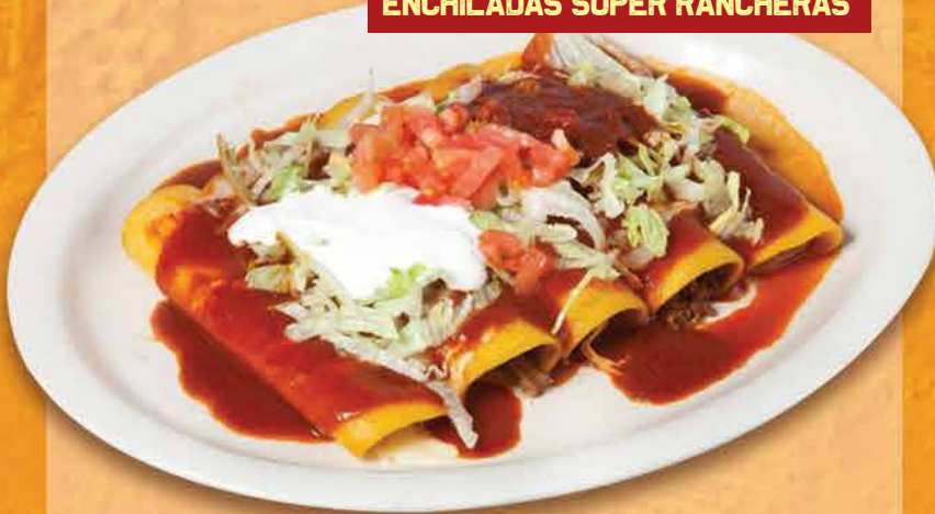
ENCHILADAS SUPER RANCHERAS

Three burritos filled with grilled chicken and rice. Topped with melted queso and verde salsa