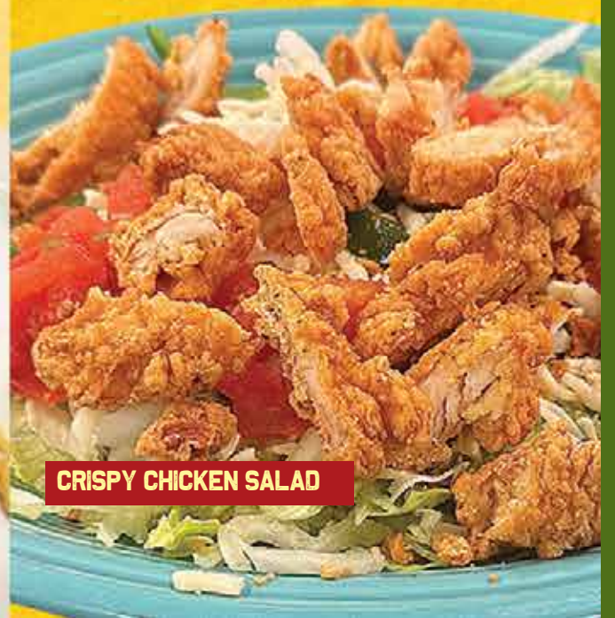
CRISPY CHICKEN SALAD