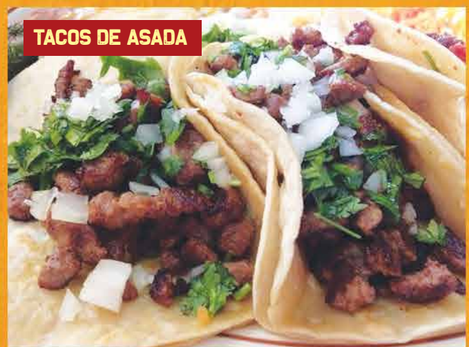
TACOS DE ASADA

SOPE $5.00 Three $12 Fried corn masa bowl topped with beans, shredded cabbage, cheese, sour cream and tomatilla salsa. Choice of shredded chicken, shredded beef or ground beef. GRILLED CHICKEN OR STEAK $6.00 THREE $15