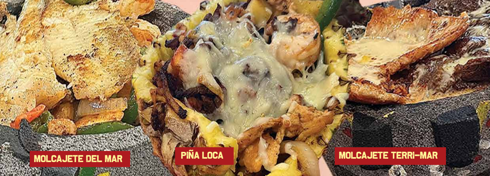
MOLCAJETE DEL MAR