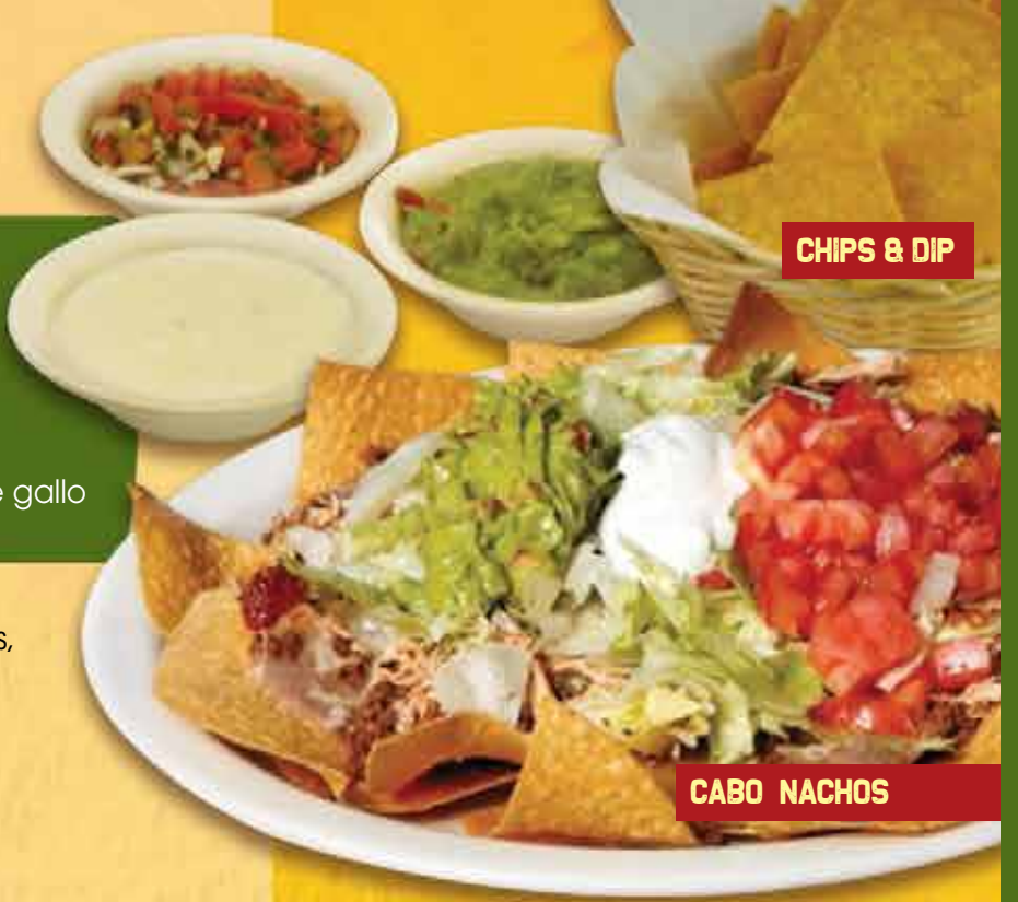
CHIPS & DIP